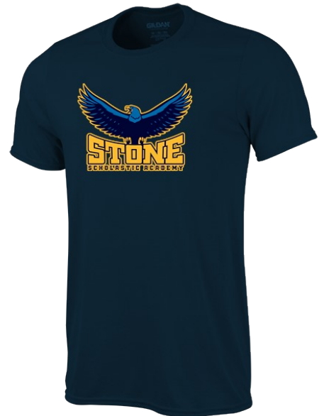
YOUTH/ADULT PERF TEE $17

10% Of Every Purchase Directly Supports STONE SCHOLASTIC ACADEMY