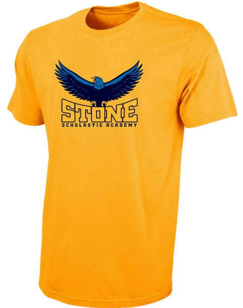
YOUTH/ADULT 50/50 TEE $15