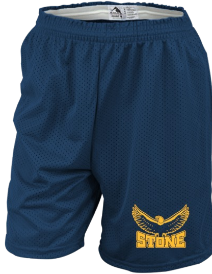
PREMIUM SHORTS $22