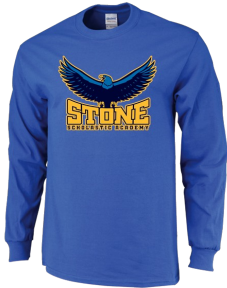
YOUTH/ADULT LONG SLEEVE TEE $18