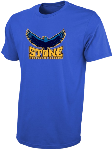
YOUTH/ADULT 50/50 TEE $15