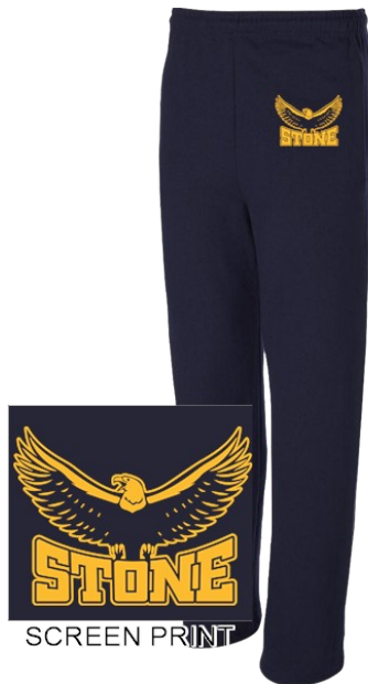
YOUTH/ADULT SWEATPANTS $26