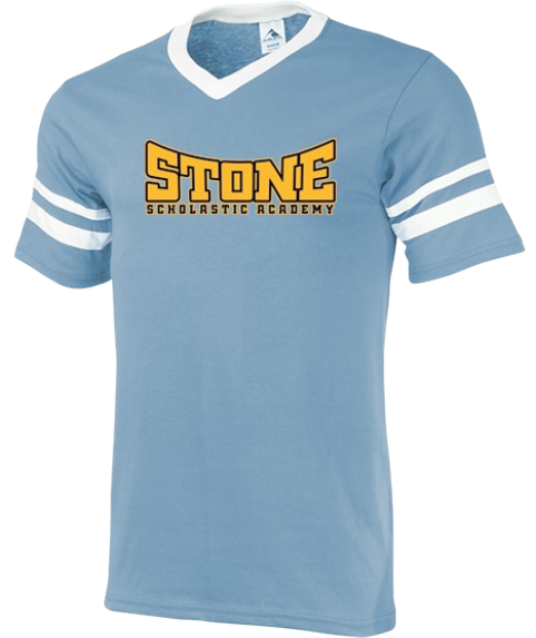
YOUTH/ADULT JERSEY TEE $24