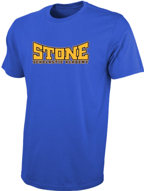
YOUTH/ADULT 50/50 TEE $15