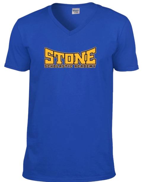
MEN/WOMEN V-NECK TEE $18

10% Of Every Purchase Directly Supports STONE SCHOLASTIC ACADEMY