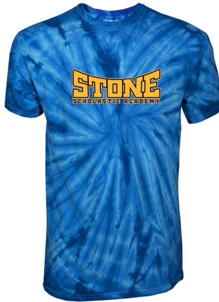
YOUTH/ADULT SPIDER TIE DYE $19