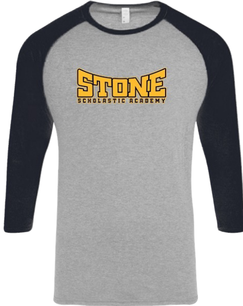
YOUTH/ADULT BASEBALL TEE $23