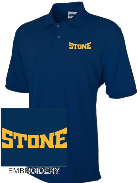
YOUTH/ADULT JERSEY POLO $23